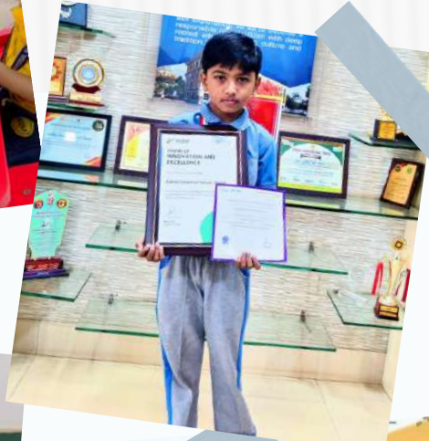
International Logiquids Olympiad