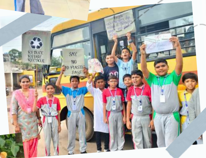
World Paper Bag Day