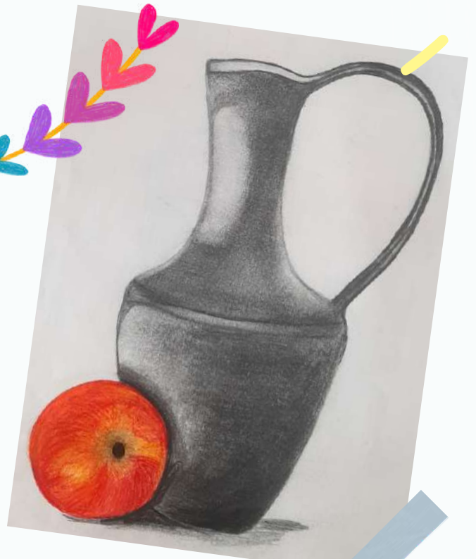
Dyaneshwari Karade X - A