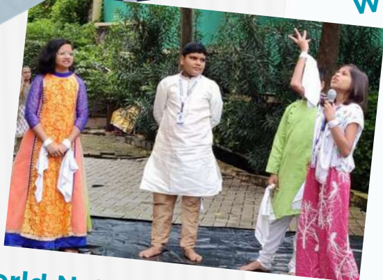
World Nature Conservation Day