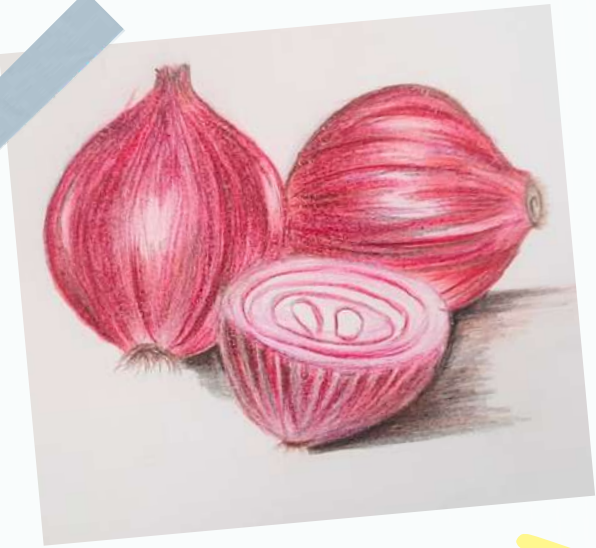
Avani Hande X - A