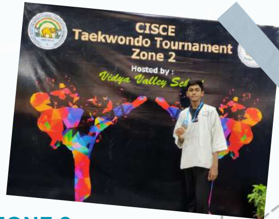
CISCE PUNE ZONE 2 Taekwondo Tournament