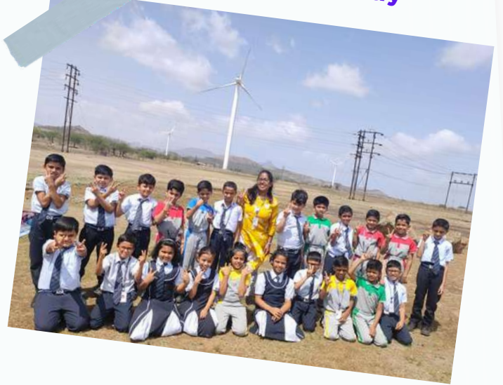
World Wind Day