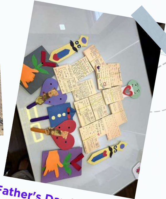
Father's Day Post Cards