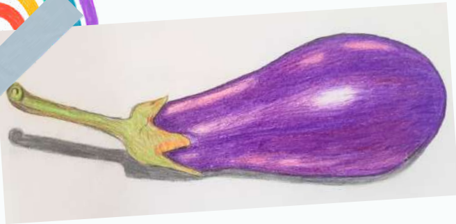
Chahat IX - A