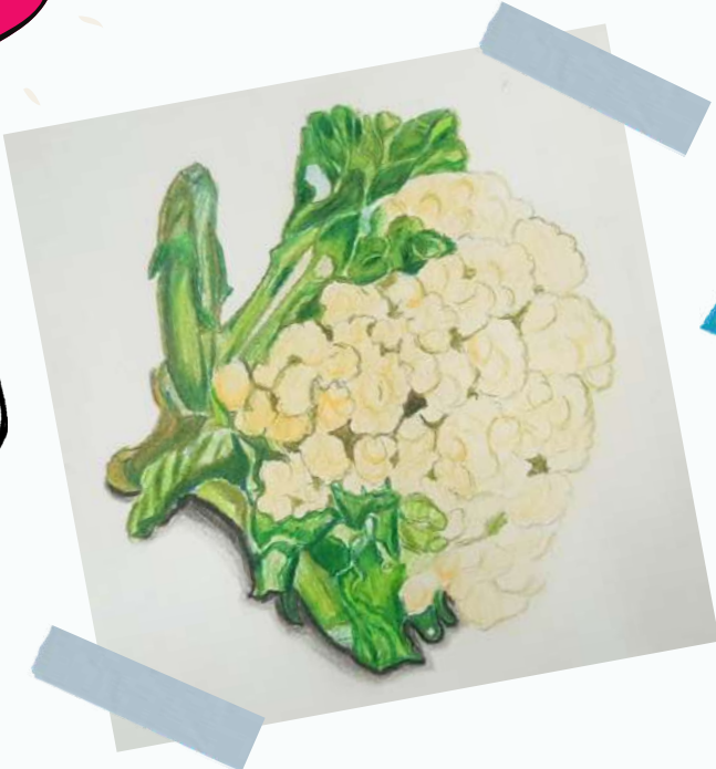
Sahil Walzade X - A