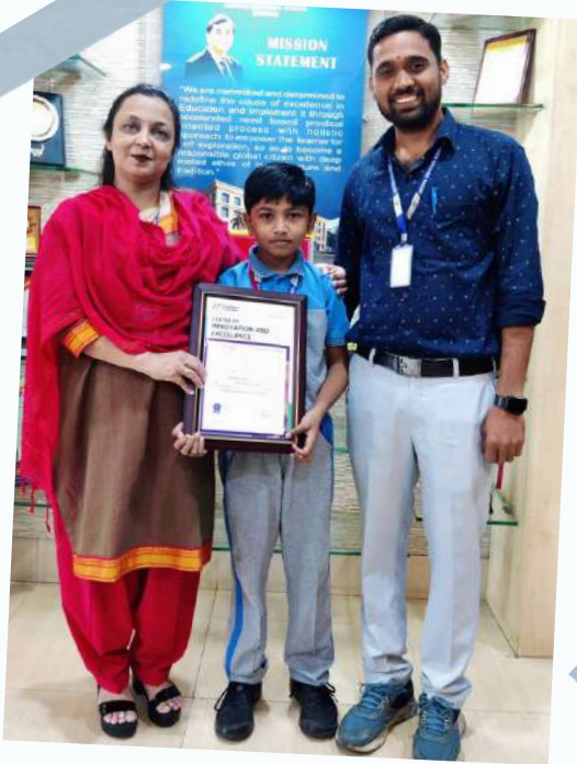
International Logiquids Olympiad