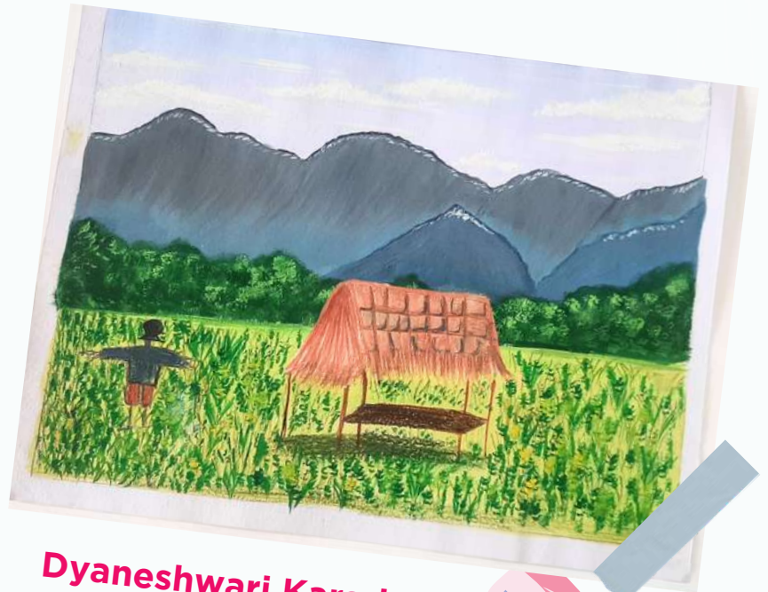
Dyaneshwari Karade X - A