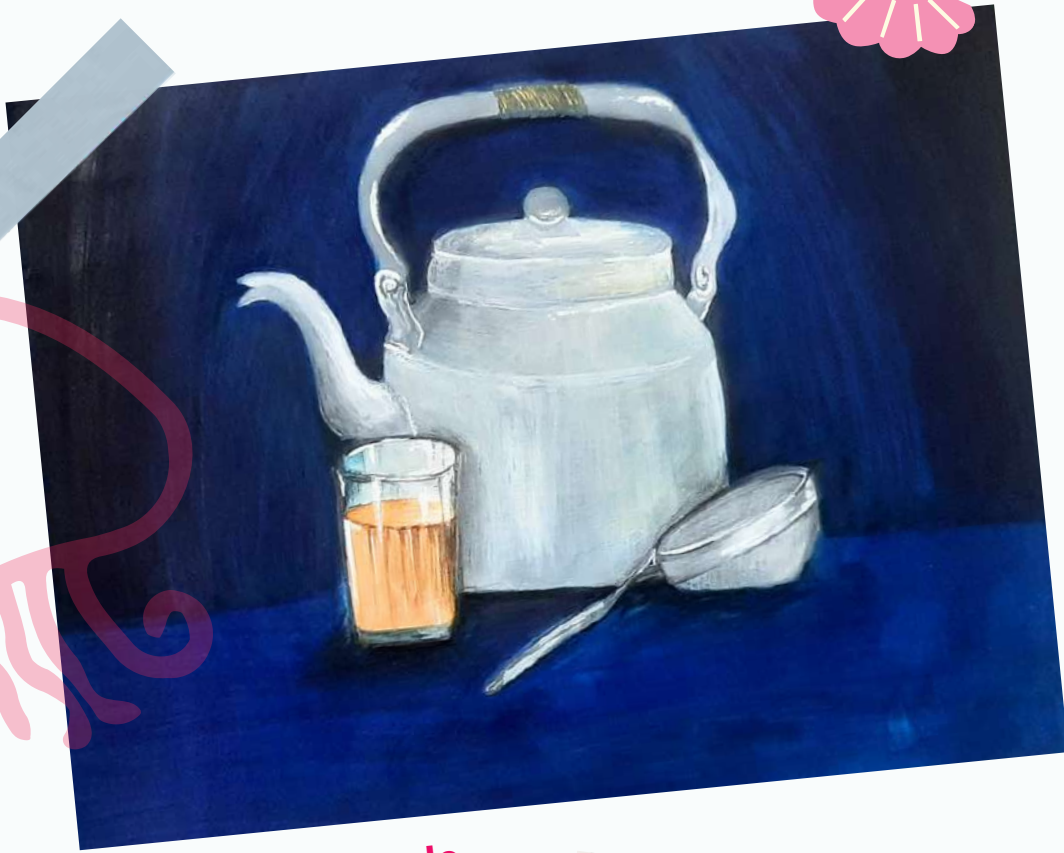
Avani Hande X - A