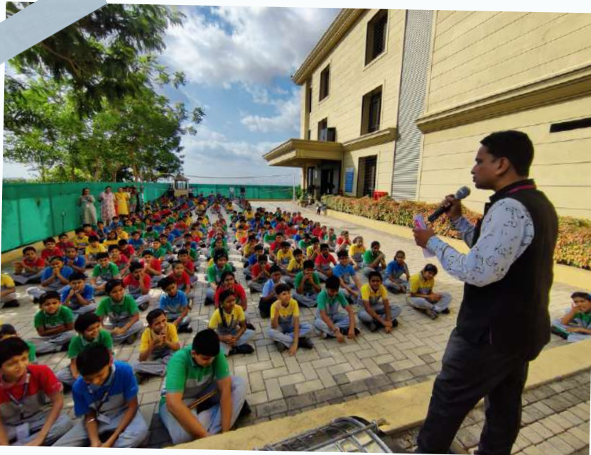
Say No To Plastic Day