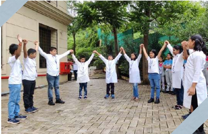
World Nature Conservation Day - Special Assembly