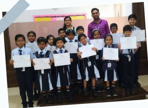
Marathi Poem Recitation

EXPANDING CONNECTONS AND DEEPENING OUR ROOTS THROUGH - 'SAMPARK'