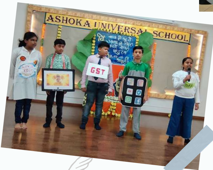
World Social Media Day