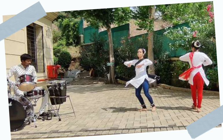
International Music and Dance Day