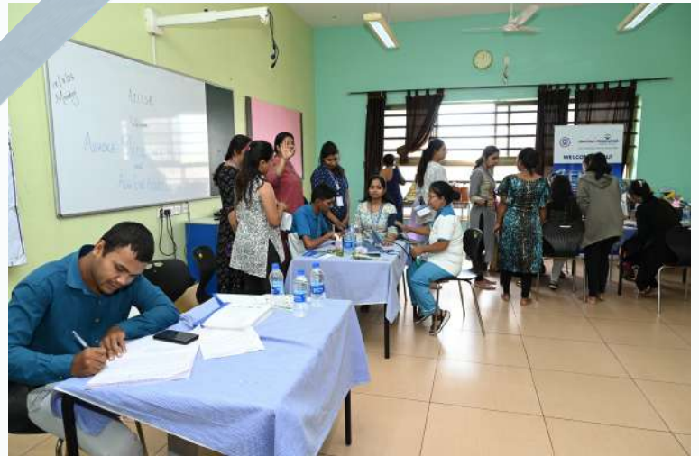
Ashoka Medicover Drive