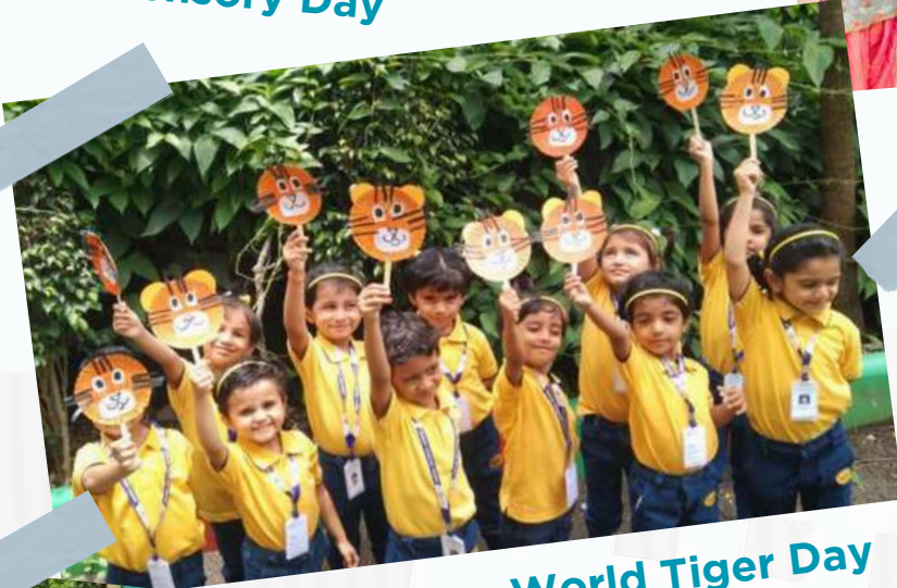
World Tiger Day