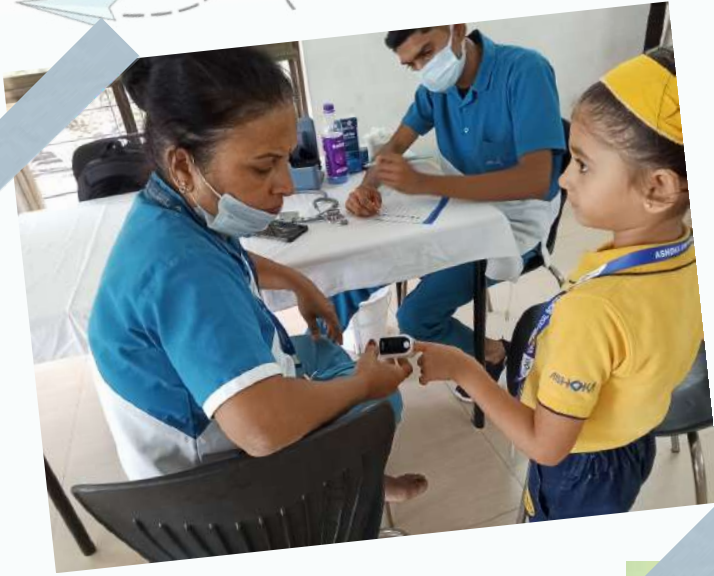
Student Health Checkup