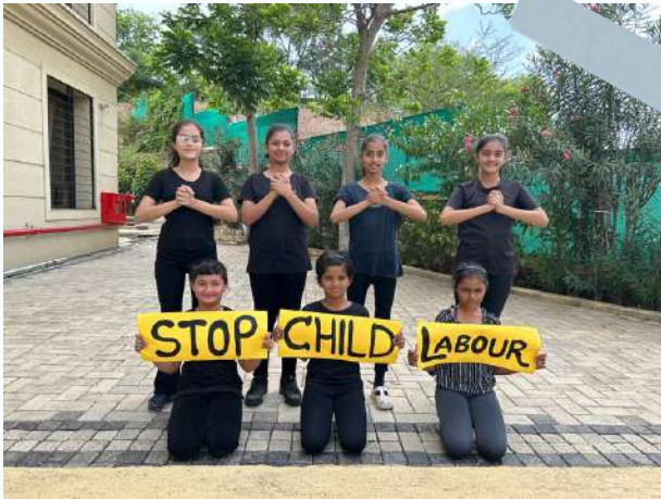
Child Labour Day